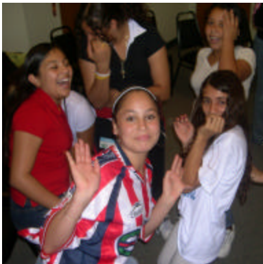
Girls have fun getting to know each other!

On October 6, 2005, 6th, 7th and 8th grade girls from Apopka Middle School had an Empowerment Mini-Retreat at St. Francis. Five 9th grade girls heard about the retreat and asked to attend. The girls and OFFM's supporting staff had a fantastic time. There were tears, laughter, great food, singing, and tremendous connections. Facilitators helped girls to