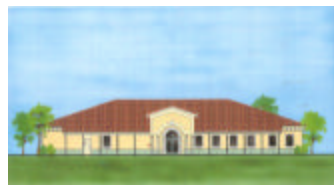
Hope CommUnity Center 1016 North Park Avenue Apopka, Florida 32703

Our total project will cost $1.7 million dollars. We celebrate having raised $1.1 million from private donors like yourself, the farmworker and immigrant community, the Catholic Diocese of Orlando and the Federal government. The picture below provides you, our faithful supporters, with our vision of the new Center.