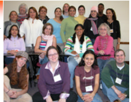
Americorps team 2005-06

God only asks of us three things: to act justly; to love tenderly and to walk humbly with God. Micah 6:8