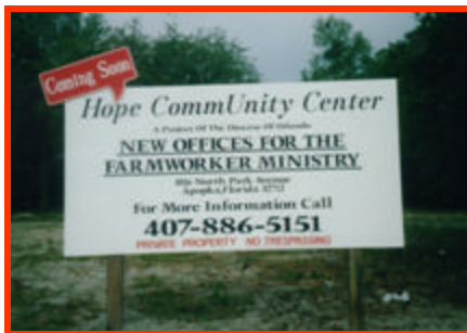
Groundbreaking Ceremony June 23

The Hope CommUnity Board of Directors and the fundraising committee are invaluable resources who continue to make this dream a reality. Their support and ongoing effort are greatly appreciated by OFFM staff and the community they serve. They will continue to offer creative ideas for OFFM's new home and for programs which give life to the center.