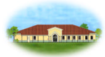
The Hope CommUnity Center 1016 North Park Avenue Apopka, Florida 32703

churches and community centers. The new center will enable OFFM to more efficiently serve the community by providing space for some of our offerings such as parenting classes, counseling and after school tutoring.