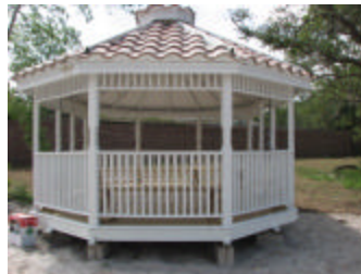
An image of the Hope CommUnity Center's gazebo

OFFM appreciates every donation regardless of the amount as each dollar helps the ministry.