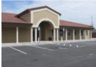
1016 North Park Avenue