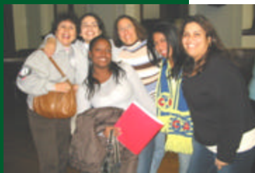
The 2006-07 team celebrating at a national retreat

Bored? Searching for a change? Looking for ways to give back but don't know how to start? Notre Dame (NDA) AmeriCorps needs you! Spend a year working with people from all places and backgrounds doing things such as helping others learn English or assisting someone on their journey to citizenship.